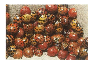
Fig. 4. Clustering activity of H. axyridis adults.