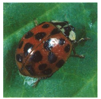
Fig. 1. Harmonia axyridis adult, fully spotted individual.

Harmonia axyridis (Pallas); Family: Coccinellidae