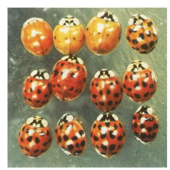
Fig. 2. Typical color variation found in H. axyridis adult population.